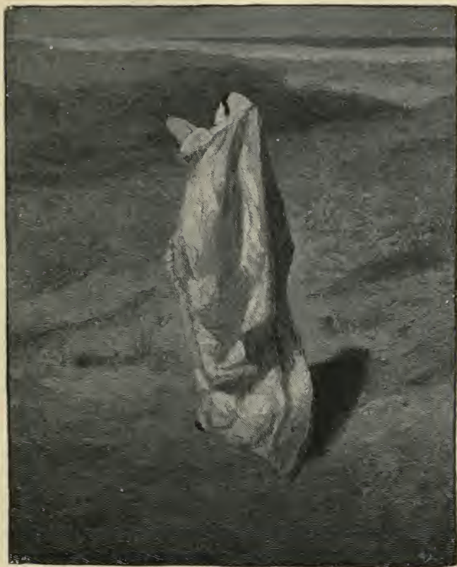
"JUDITH." Page 316.